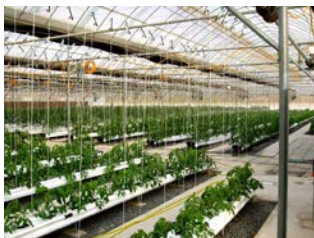
Nursery or Greenhouse (planting, potting, pruning, watering, harvesting)