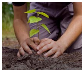
Forestry (soil preparation, planting, growing, cutting trees)