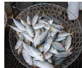
Fishing & Fish Processing (catching, sorting, packing, transporting fish)

This form and the data recorded within are protected to maintain family and child confidentiality. If you have any questions, please contact: