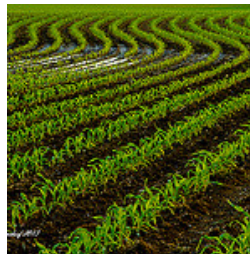
Agriculture or Field Work (planting, picking, sorting crops, soil preparation, irrigation, fumigation)