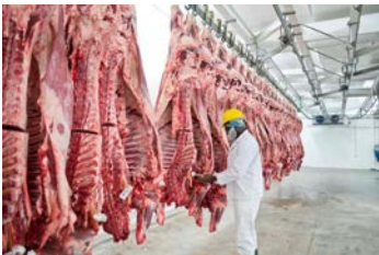
Processing & Packing (fruit, vegetables, chicken, eggs, pork, beef, lamb or other livestock)

CIRCLE all that apply below, even if the work was only for a short period of time.